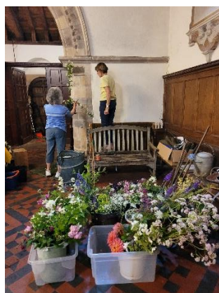
10o'clock in the morning....