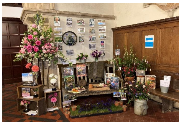
The finished display at 5pm.